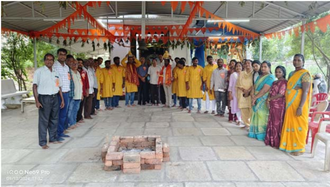
After Laddu Action, the ESCI Group photograph at Vijaya Ganapathi Temple in ESCI Premises

The Ganesh Immersion celebrations at the Engineering Staff College of India concluded with much fanfare and jubilation. The Ganesha statue installed in the Vijaya Ganapati temple in the college premises on Vinayaka Chavithi day on 7th September, 2024 was immersion on 13th September after 7 days. The College staff, students from SPGS participated in the immersion programme held at the Malkam Cheruvu near Khajaguda.